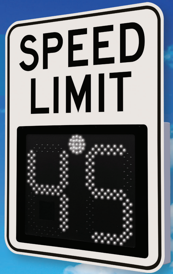
Choice of faceplate colors available

The new Traffic Logix® SafePace® 550 Variable Speed Limit Sign offers the flexibility to display speed limits based on work or school zone scheduling. Using highly visible LEDs, the SafePace 550 Variable Speed Limit Sign ensures that motorists are aware when the speed limit has changed.