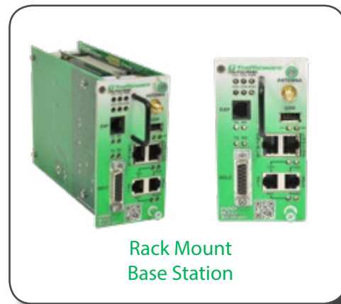
Rack Mount Base Station