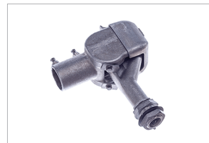
Rubber Cushioned Mast Arm Hanger